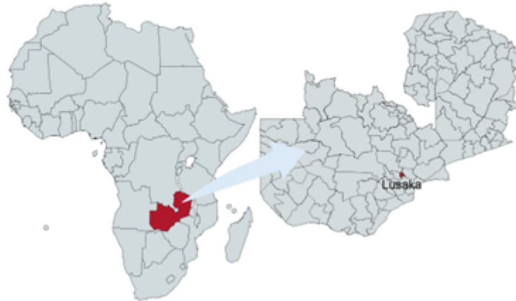
FIGURE 1. Location of Zambia and Its Capital, Lusaka